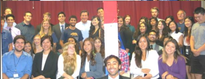
Volunteer kickoff rally at the Davis HQ (photo above). One of several HQ phone banks (photo left).