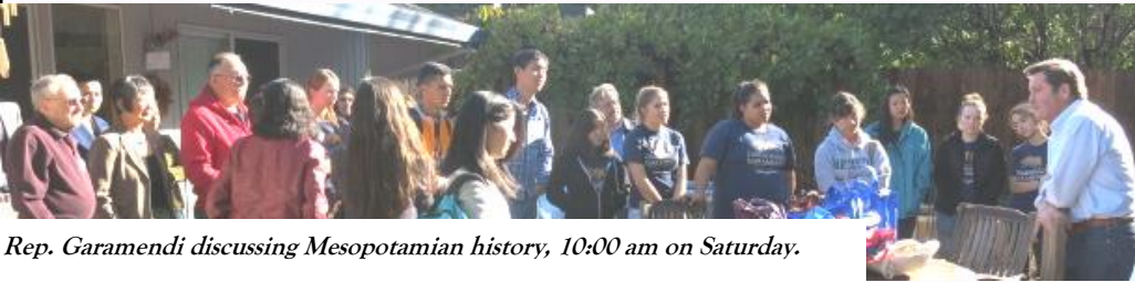
Rep. Garamendi discussing Mesopotamian history, 10:00 am on Saturday.